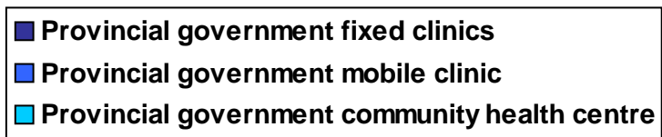
Figure 4.2 Types of participating health facilities (N=62)